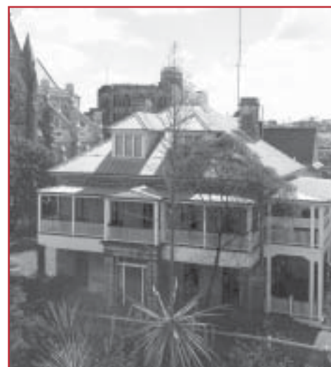
The Deanery showing the historic veranda. Note the newly completed Stage 2 of the cathedral nave in the background C1964-68.