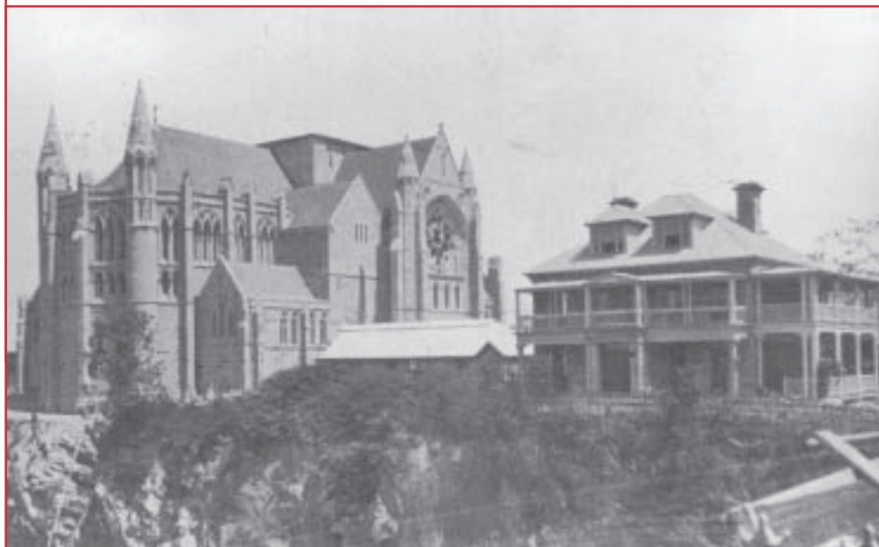
The Deanery and Stage 1 of the cathedral C1910. Note Adelaide St Cliff in front of the cathedral precinct.