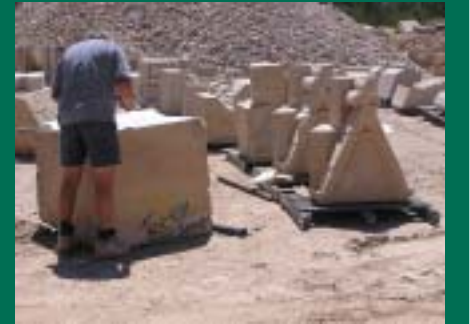
TOP: The complete North Aisle with scaffolding removed.